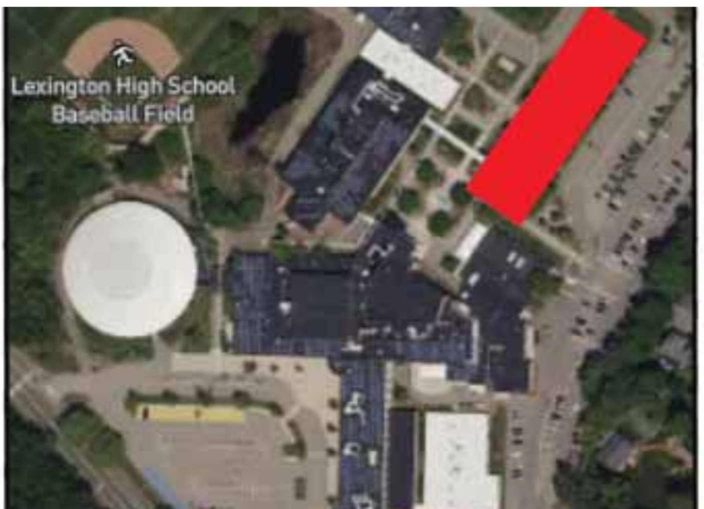
PROPOSED LOCATION OF STAGE ONE

PLEASE JOIN LHS4ALL FOR A PUBLIC PRESENTATION AND COMMUNITY DISCUSSION (IN-PERSON AND VIRTUAL) ON WEDNESDAY NOVEMBER 6TH, 6-8PM AND AGAIN FROM 8-10PM