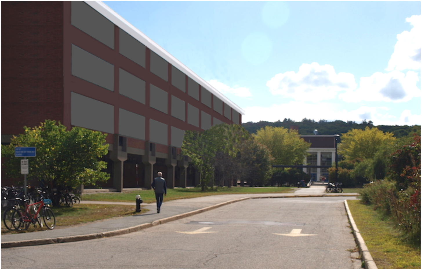
ELEVATION VIEW OF STAGE ONE